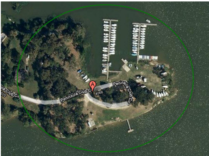
Satellite View C